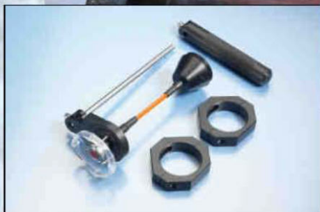
Optional probe holder and mounting kit

Distributed by NDT Equipment Services Ltd 11, Vaux Road, Finedon Road Ind. Est. Wellingborough, Northants. NN8 4TG Tel: +44 (0) 1933 274833 Fax: +44 (0) 1933 274113 Email: saleshire@ndt-es.co.uk